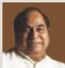
H. E. Dr. D. Y. Patil Governor of Tripura