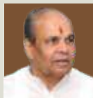
H. E. Shri K. Sankaranarayanan Governor of Maharashtra