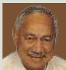
Hon'ble. Mr. F. H. Faleomavaega Member of Congress, U.S. House of Representative, Washington