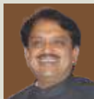
Shri Vilasrao Deshmukh Union Minister for Science & Technology and Earth Sciences, Government of India