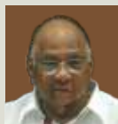
Hon'ble. Shri Sharad Pawar Union Minister for Agriculture & Food Processing Industries, Govt. of India

10.00 AM - 11.00 AM Conference Inauguration and Awards Function by